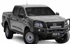
Nissan Navara D23 12/20+ PN. BPEPWBD2321