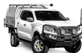
Nissan Navara NP300 PN. BPEPWBNP300