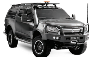
Holden Colorado 2016+ PN. BPEPWCOLDM