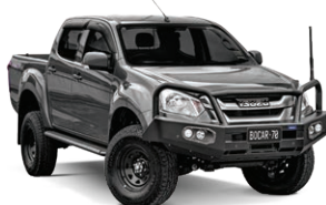
Isuzu D-Max 01/17-09/20 PN. BPEPWCOLDM