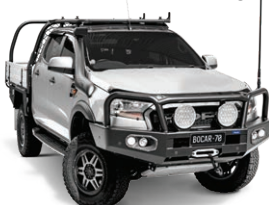
Ford Ranger PX2 & PX3 PN. BPEPWBRAN15