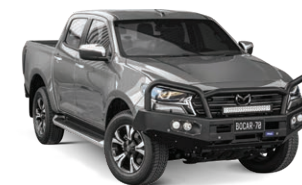
Mazda BT-50 2020+ PN. BPEPWBBT5020