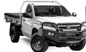
Mitsubishi Triton MR PN. BPEPWBTRI18