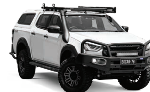
Isuzu D-Max 09/20+ PN. BPEPWBDMAX20