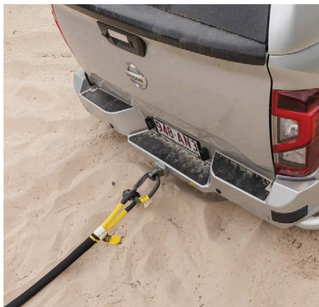
A TJM soft shackle provides a simpler and safer means of vehicle recovery.